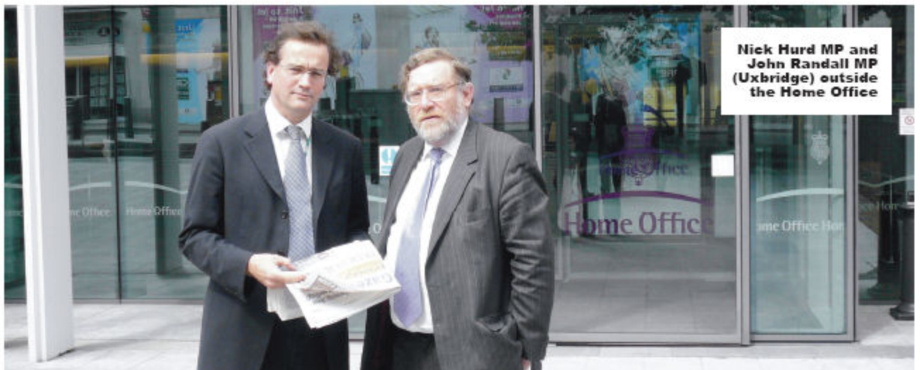
Nick Hurd MP and John Randall MP (Uxbridge) outside the Home Office