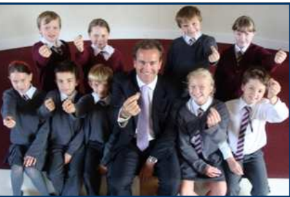
Supporting the Young Savers initiative at Newnham School.

Would you like me to come and visit your school? Contact the constituency office on 01923 822876