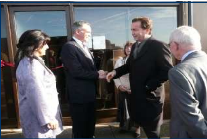
Opening a new business in Northwood.