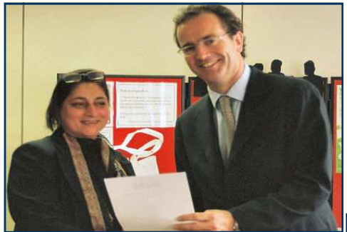
Over one hundred people completed their vocational certificates at the JGA groups Centre—I presented them with their certificates.