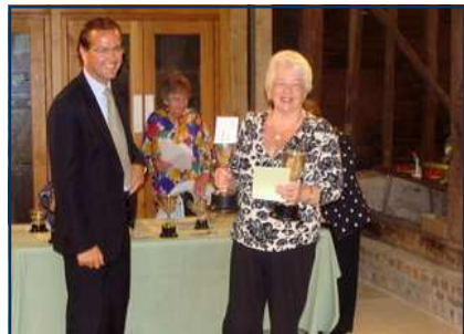
Judging the impressive exhibits at the Ruislip Horticultural Show.